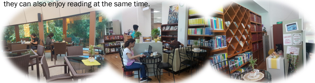
Café @ Lib extended at the Periodicals Section

On the other hand, the Periodicals Section caters mostly the professionals and senior citizens because of the newspapers and magazine collections. With this, an extension of Café @ Lib is created in this section. Seniors having coffee while reading newspapers is a bliss for them. They are our priority in the coffee area so that they don't have to go up to our Café @ Lib at the 2nd floor anymore. We added coffee tables at one side of the section to see if this will work out. Indeed, our users are thankful for having this. Not only they can have their coffee, they can also enjoy reading at the same time.